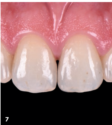
Fig. 7 - Just after the treatment