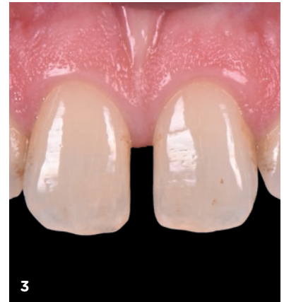
Fig. 3 - initial (Contrastor)