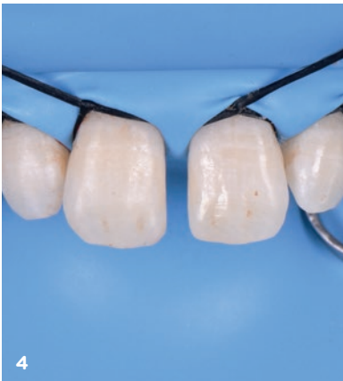
Fig. 4 - isolation