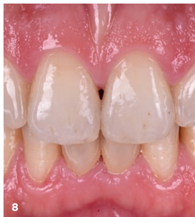
Fig. 8/9 - One week recall

Maxillary non.prep restorations were done with just OMNICHROMA Mandibular centrals were restored with direct veneers using OMNICHROMA BLOCKER and OMNICHROMA