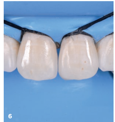
Fig. 6 - Final restorations