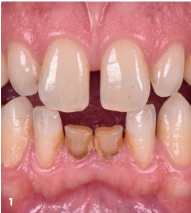
Fig. 1/2 - initial (Intraoral)